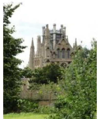
Ely Cathedral.