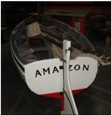
Amazon at Ruskin Museum.

We had booked the three-day pre-conference tour to the Lakes District. In early-morning London, still jet-lagged and searching for the coach departure point, this did not seem such a good idea. But as we talked with our fellow tour-takers, Japanese, Thai, Israeli, Russian, some from the US, on the long