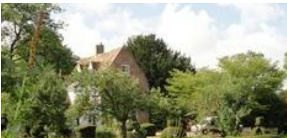
Manor House, Hemingford Grey.