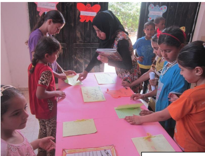
Children at al-Shawka Rafah Library

Pictures show the latest exhibition of the outcome of the children's activities at al Sikka and al-Shawka Rafah libraries... They reflect the struggle and determination of our children and people to their Right to Life, to Justice, Dignity and to Books.