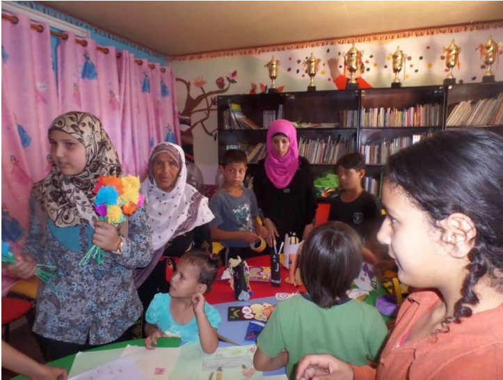
Children's activities at al-Sikka Library