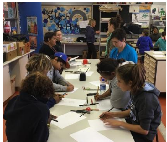
Students and teachers working together

I was able to scan some of the first day's work and whizz them up in PhotoShop with some text to show the students how their work might look on a printed page. Working with the kids one-on-one over the next two days as they revised their writing and worked up their illustrations, I felt so privileged. Some were shy to begin with but we connected very quickly by sharing ideas about their work. It was an intimate and enriching experience and fabulous to witness their stories taking physical form. I can't wait to see the artwork again after it is professionally scanned, as I'll be designing the book to be published by the ILF.