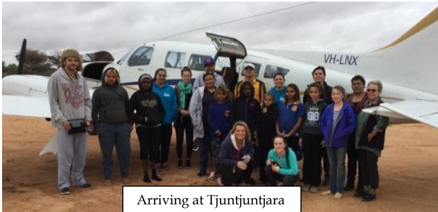
Arriving at Tjuntjuntjara