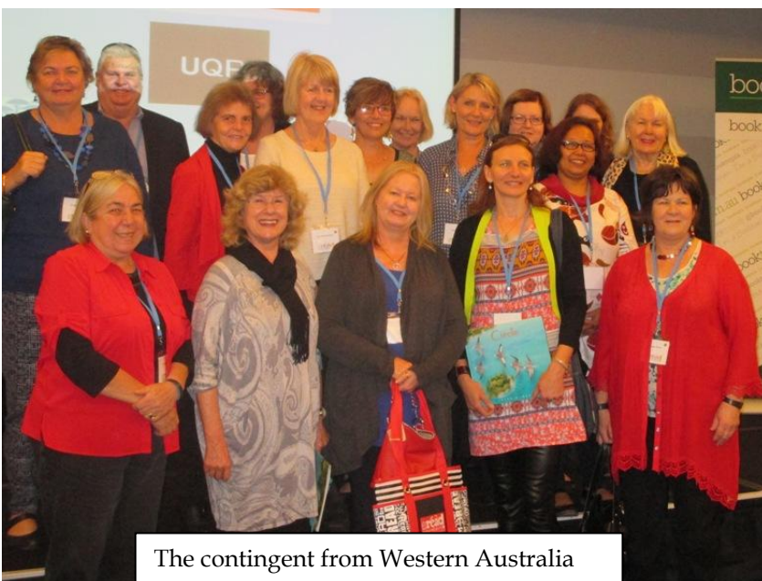
The contingent from Western Australia