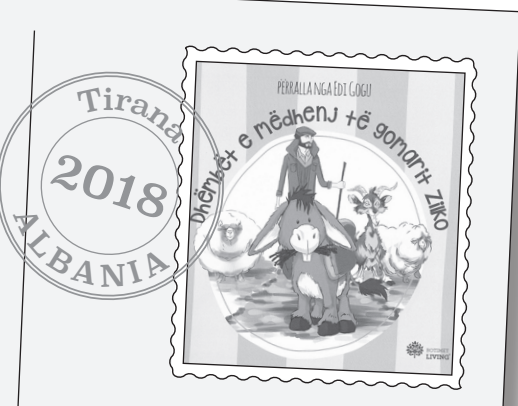
Dhëmbët e mëdhenj të gomarit Zilko (Big Teeth of Donkey Zilko)

Edi Gogu Illustrated by Jetmir Veipi Tirana, Albania: Living, 2018. 60 pp. ISBN: 0 789928 216359 (Picturebook; ages 6-9)