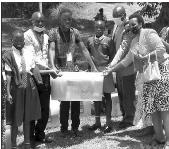
Handover of the Book Boxes

By the time the Reading Tent closed, some of the children were reluctant to leave. They said that they had enjoyed reading the books, and some of them even told the audience what they had read about. They also enjoyed meeting fellow pupils from other schools and making friends. They had liked the place, enjoyed the food, and looked forward to reading the books given to their schools.