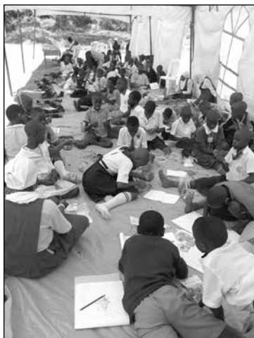
Children enjoying the Reading Tent

A WhatsApp group was set up by the teachers, and they have been frequently exchanging ideas, including ideas for how to share the books with neighboring schools that did not get an opportunity to be invited to the event.