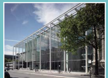
Imperial College London